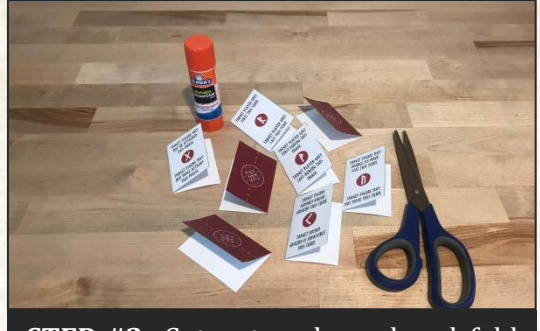
STEP #2: Cut out each card and fold them in half.