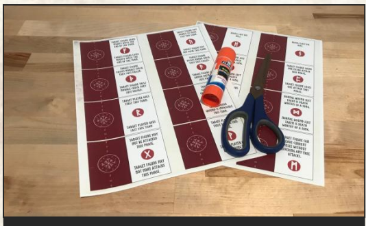
STEP #1: Print the Rune cards on sturdy paper. You'll need scissors and a glue stick.