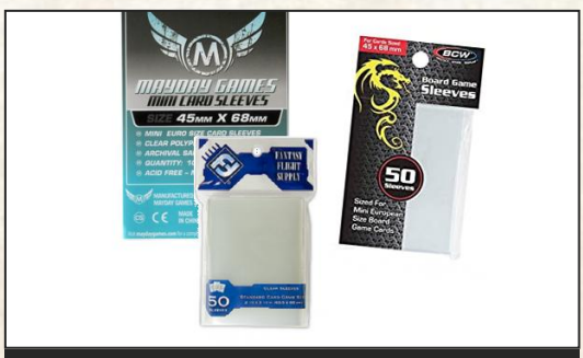
OPTIONAL STEP #4: Plastic protector sleeves can be found for as little as $3 per 50 sleeves!